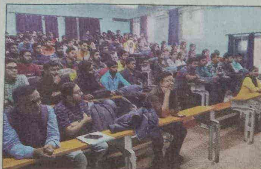
सेमिनार में उपस्थित विद्यार्थी

बी सांसद चुनाव चलाने सामन के स कि स सरका गौरत की स था। इ भी व ने आ विचार वालों पड़ा। सड़क सांसद गंभीर